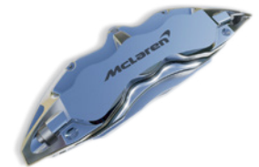
Polished with black McLaren logo