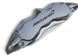
Silver with black McLaren logo