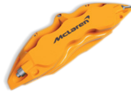
McLaren Orange with black McLaren logo