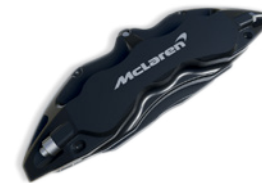
Liquid Black with silver McLaren logo