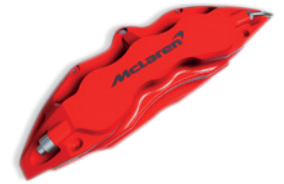
Red with black McLaren logo