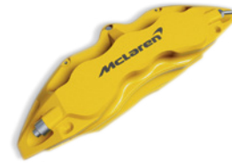
Yellow with black McLaren logo