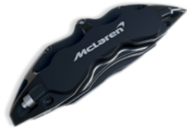
Black with silver McLaren logo